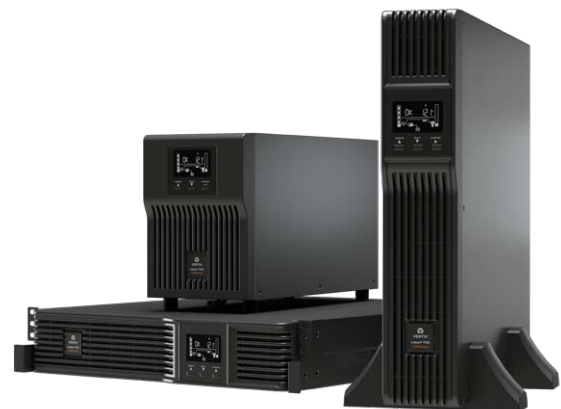
Vertiv™ Liebert® PSI5 Lithium-Ion

A five-year industry-leading warranty comes standard with the Liebert PSI5 Lithium-Ion 3kVA Short-Depth UPS, offering additional purchase protection for complete peace of mind.