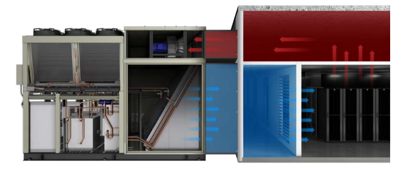
The Liebert DSE freecooling solution is scalable in 400kW and 500kW unit capacities, with both perimeter and rooftop configurations to support growing and changing data center loads and site requirements.

Vertiv.com | Vertiv Headquarters, 1050 Dearborn Drive, Columbus, OH, 43085, USA