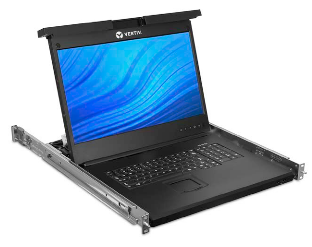
Avocent® 19" Local Rack Access Console

A local access controller provides access to multiple servers to simplify the process of making software upgrades, troubleshooting and system monitoring. They provide an ideal solution for local management of remote sites but are not designed to support remote management.