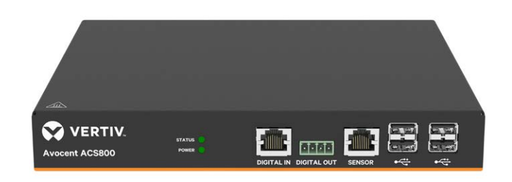
Avocent® ACS 800

An advanced serial console enables remote management of servers, routers and switches, in addition to supporting capabilities such as environmental monitoring and internet of things (IoT) integration. It is also an ideal foundation for centralized management of multiple remote sites. For example, a system such as the Avocent® ACS 800, which is designed for edge site management, includes sensor ports to connect temperature, humidity, differential pressure, leak, and door pin sensors in addition to remote equipment access.