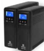
Vertiv™ Liebert® PSA5 UPS, 500-1500VA