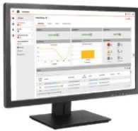
Vertiv™ Environet™ Alert