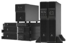
Vertiv™ Liebert® PSI5 Line-Interactive UPS, 750-5000VA