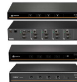
Vertiv™ Avocent® Cybex™ SC800 and SC900 Secure Desktop KVM Switches