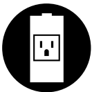
UPS Maintenance Services