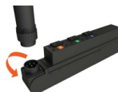
Vertiv™ Geist™ UPDU, Universal Power Distribution Unit