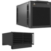
Vertiv™ VRC Rack Cooling System, 3500 Watts