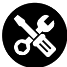
Installation & Startup Services