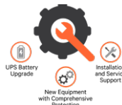
Power Continuity Services