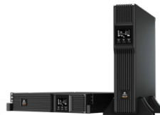
Vertiv™ Liebert® PSI5 UPS, TAA-Compliant, 1,500-3,000VA