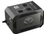
Vertiv™ Liebert® Power-UPS Lithium, Lithium-Ion UPS, 400VA