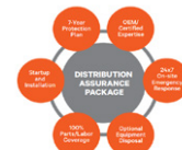
Distribution Assurance Package