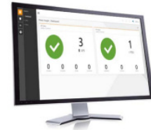
Vertiv™ Power Insight