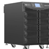
Vertiv™ Liebert® APS UPS, 5-20kVA