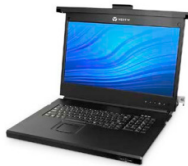
Vertiv™ Avocent® LC Local Rack Access (LRA) Console