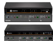
Vertiv™ Avocent® SVKM 100 Desktop KM Switches