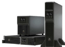
Vertiv™ Liebert® PSI5 Lithium-Ion UPS, 1500-3000VA