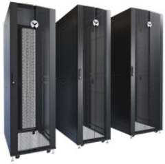
Vertiv™ VR Rack System

Deploy an all-in-one modular data center quickly for powerful computing capacity in a small physical footprint.