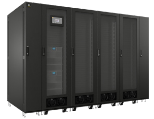
Vertiv™ SmartRow™ 2