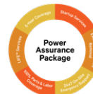
Power Assurance Package