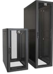
Vertiv™ DCE Rack System