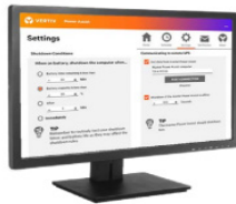
Vertiv™ Power Assist