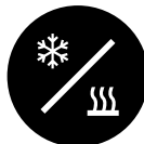
Thermal Maintenance Services