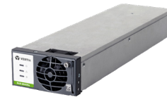
R48-3500E4 eSure™ Rectifier