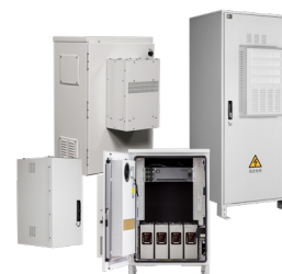
Vertiv™ Outdoor Enclosures

Space saving NetSure™ Inverter Systems maximize efficiency at 5G and Edge sites.