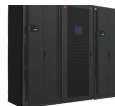
NetSure™ 400V DC Power System