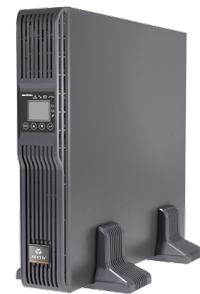
Liebert® GXT4™ UPS 500 - 10,000VA