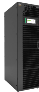
Liebert EXM™ UPS 10 - 250kVA