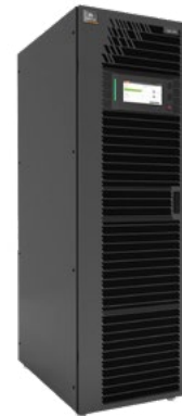
Liebert EXM™ UPS 10 - 250kVA