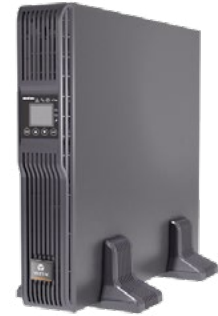
Liebert® GXT4™ UPS 500 - 10,000VA