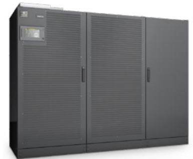
Liebert EXL™ S1 UPS 625 - 1200kVA/kW