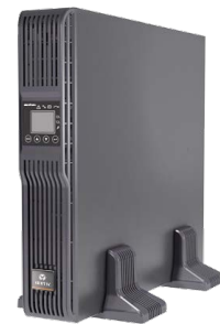
Liebert® GXT4™ UPS 500 - 10,000VA