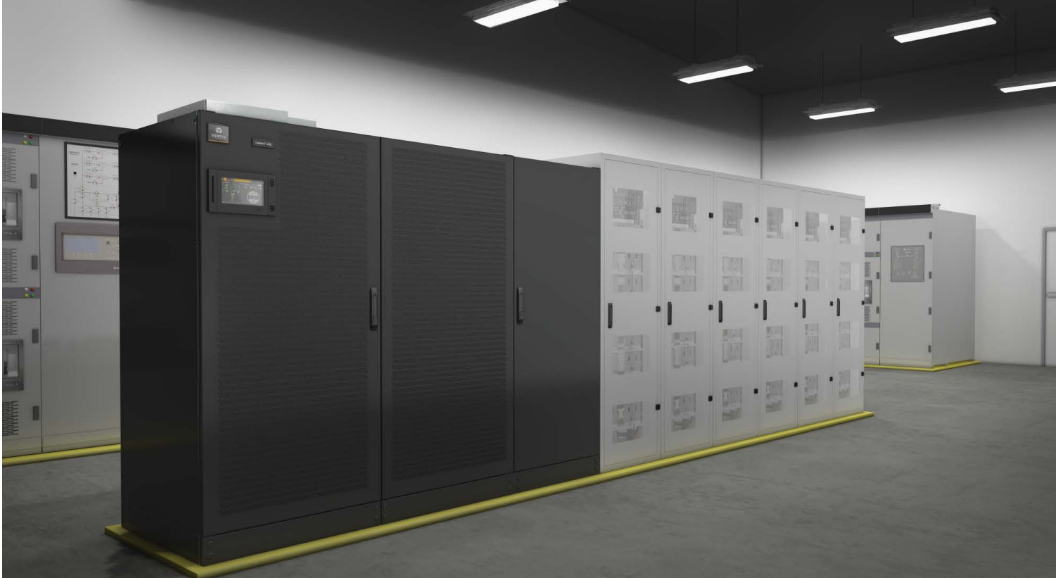
Lithium-ion Battery cabinets sit next to a 1200kW UPS

The following pages address common questions about the use of lithium-ion batteries in the critical space.