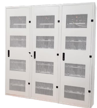
Shown: Lithium Ion Battery Cabinets for Data Center use

A. Though the accumulated runtime in the United States is currently low compared with VRLA, we can answer yes to this question given our experiences in several US installs and in Asia particularly.