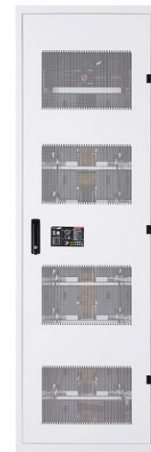
Lithium-ion Battery Cabinet