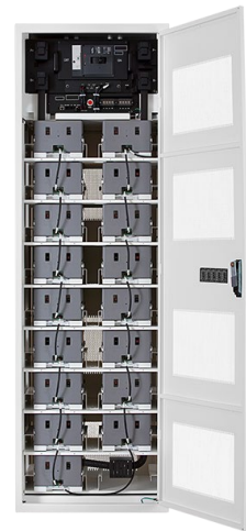
Lithium-ion Battery Cabinet for Data Centers