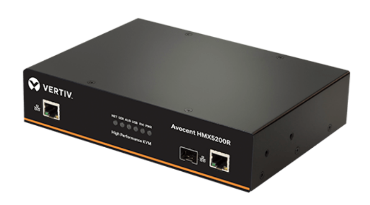
Avocent HMX 5000 Series

"The Avocent HMX 5000/6000 KVM is highly scalable and configurable, which makes it so easy to connect multiple users to multiple servers and workstations. It's really an ideal solution for a large Hollywood studio," Busby said. "Other studios in this same film and TV market could easily benefit from this cost-effective, reliable and flexible solution."